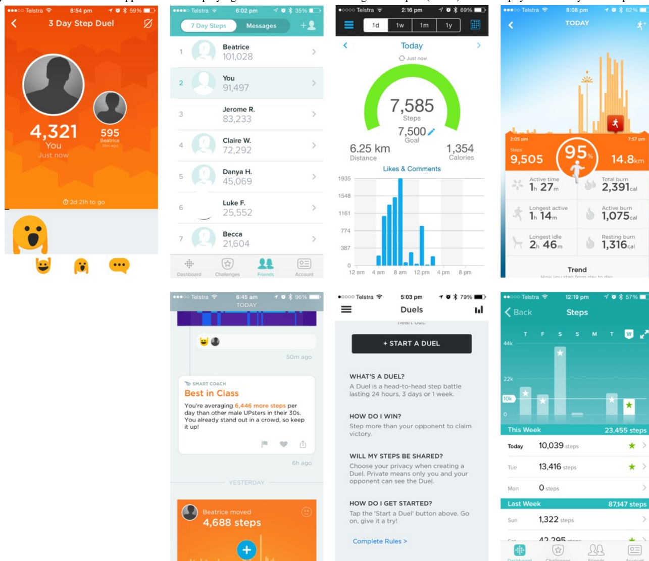
Figure 1. Screenshots of the app or website displaying how various behavior change techniques (BCTs) related to physical activity were implemented.

specified physical activity goal (Figures 1). Feedback to users on achieving a goal was typically highlighted by changing the color or pattern of a progress bar or adding a unique identifying feature to the progress bar (eg, a "star" or textured bar graph). In addition, the activity trackers of all systems vibrated and provided visual feedback to users' when the daily activity goal was achieved. The Garmin system automatically generated a goal for the user, whereas the Fitbit and Jawbone systems allowed users to set their own goal. The Garmin and Jawbone systems also automatically (Garmin) prompted a user (Jawbone) to increase their activity goal if they reached it consistently.